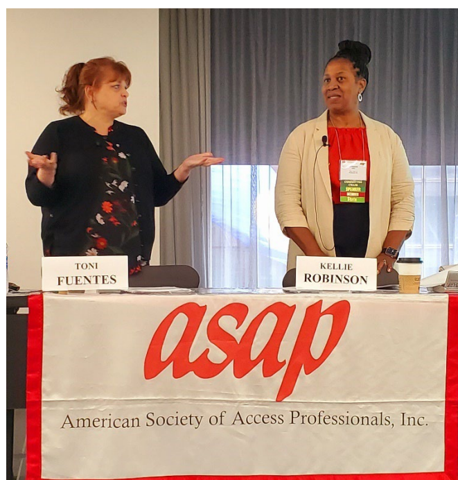
ASAP Instructors help attendees work through scenarios

All should attend as the 2024 Workshop includes interactive, advanced and basic-level sessions . Those with limited experience in processing requests for government information will benefit greatly from this training. This includes newcomers, search coordinators, and paralegals. It also includes those who deal with the Acts and records as an adjunct responsibility; or those who would benefit from an in-depth refresher course.